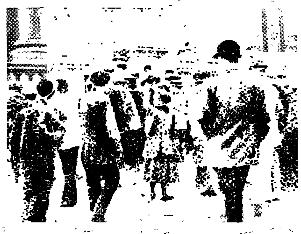
The police keeping the crowd out of the Cov Hill