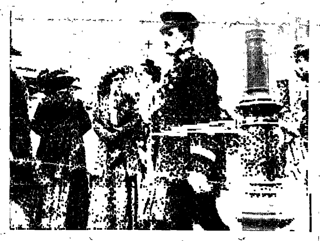
Counters Markievicz amarked with cross), one of the demonstrators who was lifted over the rails round the City Hall. She was quickly ejected by the police

Since the Lord Mayor of Dublin (Alderman Farrell) made the threat that of the Corporation refused to present an address to the King on the occasion of the Royal visit he himself would do so, there has been considerable excitement among a section of the Dublin public. The photographs were taken while the City Council was considering the position Countess Markievicz not altogether unknown in the suffrage movement took a prominent part in the proceedings. Some of the crowd managed to get into the City Hall and the appearance of the Lord Mayor was greeted with hooting and groaning.